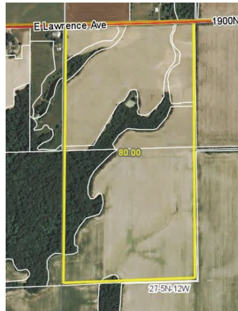
Soils data provided by USDA and NRCS.